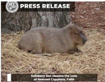
Salisbury Zoo Mourns the Loss of Beloved Capybara, Faith

The Pet Garden at Parsons Cemetery, in partnership with Holloway Pet Cremation Services, have once again donated services and an engraved brick to respectfully inter one of Salisbury Zoo's beloved animals that recently passed. In 2024 the same was done for Dweasel, a 7-year-old black-handed spider monkey. Dweasel, a cherished member of the zoo's family, passed away on September 11, 2024, after complications from surgery. Faith, a capybara, was 10 years old when she passed. She had been a cherished member of Salisbury Zoo, bringing joy to staff and visitors alike with her gentle nature and endearing quirks.