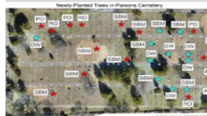
Here is a map of the 32 trees we have planted in the last two years thanks to grants from the Chesapeake Bay Trust and the City of Salisbury. Join us next Saturday October 25th at 1:00 PM for a tour of the 60 tree varieties in the cemetery.