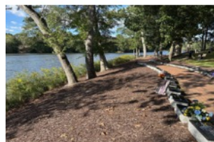
The plantings that were part of our shoreline preservation project have really taken hold. The walkway along the water is just one of the many places at Parsons to reflect on nature’s beauty and Salisbury’s history. We have several self-guided walking tours that you can download to your mobile device and learn about those who came before us.