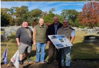
On October 25th, we dedicated the renovated flagpole behind the Parsons Cemetery Office. The flagpole has been there since at least the 1920’s and was the site where Salisbury’s Memorial parades ended and the ceremonies were held. Thank you to the donors of time and money who made the reno-