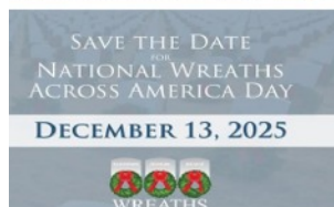
Our 9th yearly Wreaths Across America event will be held on December 13th. The procession to the ceremony area starts to form at 9:00. Please join us. Please also consider donating wreaths for the event. Go to the Wreaths website https://www.wreathsacrossamerica.org/ and follow the instruction to donate to Parsons Cemetery. If you have any difficulty, feel free to contact us for assistance.