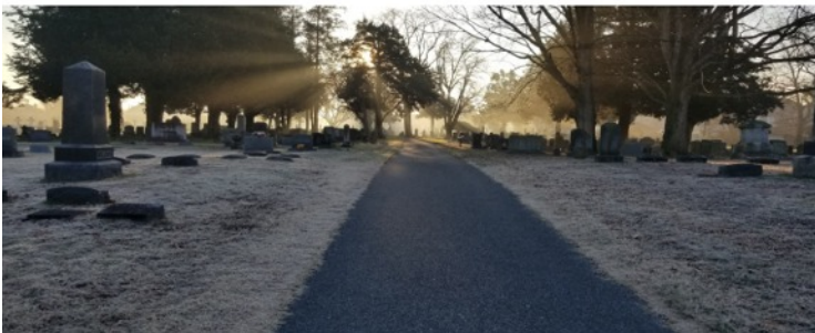
To maintain and upgrade our cemetery, we rely on donations, grants, and volunteers for anything beyond basic operational costs. We thank you for your continuing support. Please consider remembering Parsons in your will and IRA distributions so that we can remain a beautiful, well-maintained community asset for generations to come.